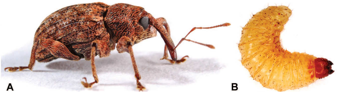
Fig. 2. Avocado seed weevil Conotrachelus perseae (A) adult and (B) larva.

with a semi-sclerotic appearance, was notable. Incomplete peritreme was visible at the anterior and dorsal parts of the spiracles. In most of the collected fruits, 1 or 2 larvae were found, but occasionally up to 16 larvae were counted in a single fruit. The larvae emerged from the fruit and buried themselves in the soil to pupate. After 40 d in the soil, the adults emerged. In the plots where damaged fruits were collected, the level of infestation was approximately 60% of the fruits, and the distribution of affected trees in the plots was aggregated. The above descriptions of both adults and larvae coincide with those previously described by Barber (1919), Muñiz (1970), and Llanderal & Ortega (1990).