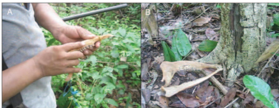
Fig. 6 The day after the Loojil Ts'oon is performed, the hunter must: (a) go to the forest to deposit, that is, give back the jaws [larger in (b)] so that the Lords of Animals give them new life, thus completing the cycle and renewing the hunting permission as established by the supernatural entities. Source: Photos by Dídac Santos-Fita; X-Pichil community, Quintana Roo (2011)

The fact that only the jaws of deer and peccaries are accounted for and given back to their Masters stands out. We are none the wiser as to why it is exclusively