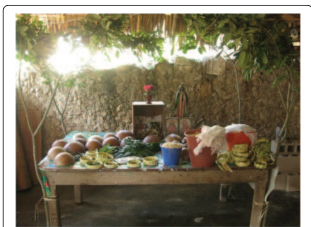
Fig. 2 Ceremonial deposit, where most of the acts of the Loojil Ts'oon ritual occur. X-Pichil community, Quintana Roo (2011)

The Loojil Ts'oon ritual is structurally complex in its richness of material objects, prayers, and symbolisms. It contains and links elements of both Mayan cosmovision and catholic tradition and it involves diverse members of the community that might participate actively or not. Most of its acts occur around the sacred space. This space constitutes the so-called “ceremonial or ritual deposit” ( depósito ritual o ceremonial in Spanish), which in the recorded Ritual consists of a table and the space that surrounds it (Fig. 2). According Danièle Dehouve (Pers. Comm., 2011), this concept implies that ritual practices of Mesoamerican indigenous peoples, from pre-Hispanic times and living on to this day, are composed of much more than simple or random acts. The expressions and manipulation of objects on the floor or on the furniture is not done by chance nor are these artifacts deemed simple gifts. These objects go well beyond the role of acting as offerings (from the Latin offerenda : things to be given). Additionally, this implies that sacrifice is not necessarily the central aspect of the Ritual, but rather another act within it [61]. Groups like the Chontal, the Mixe, the Nahua, the Totonac, and the Tlapanec, among