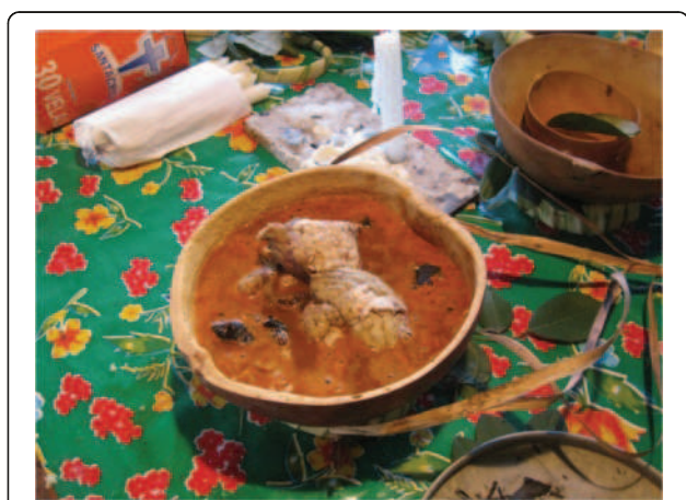
Fig. 4 “ Sip soup” ( jo'och Sip ): a special offering for the spirit/evil-wind called Sip , the main entity among the Lords of Animals. X-Pichil community, Quintana Roo (2011)

The j-men delivers the squash-pot with the cleansed soup to two helpers. They exit the house and take the right hand street. In almost complete darkness, they complete a walk on foot through the streets always taking left turns (counterclockwise), until they reappear on the opposite side of the street on which they started. During their walk the j-men's helpers spill some “ Sip soup” on the ground and throw a twig from the sip che' bouquet, which was previously used for the cleansings,