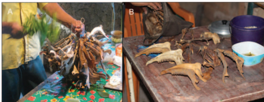
Fig. 5 As an important part of the Loojil Ts'oon : (a) the j-men, in his role as a ritual specialist, cleanses the prey's jaws (only deer: Odocoileus virginianus, Mazama spp.; and peccaries: Tayassuidae), (b) which the hunter has kept during the allowed hunting period in order to ritually remove the evil-wind ( mal aire in Spanish) they have accumulated in death and thus return them in a proper state to their owners and guardians in the forest.