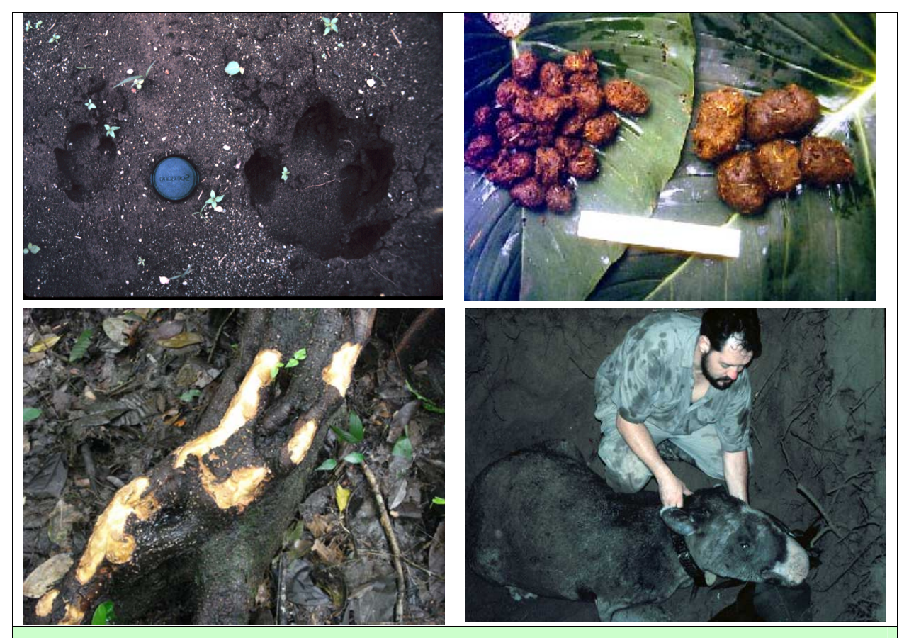
Fig. 3. Upper left and right: tracks and feces of adult female and young. Lower left and right: bark of Vatairea lundelii bitten by a tapir and tapir captured and radio-marked in the Lacandon Forest.