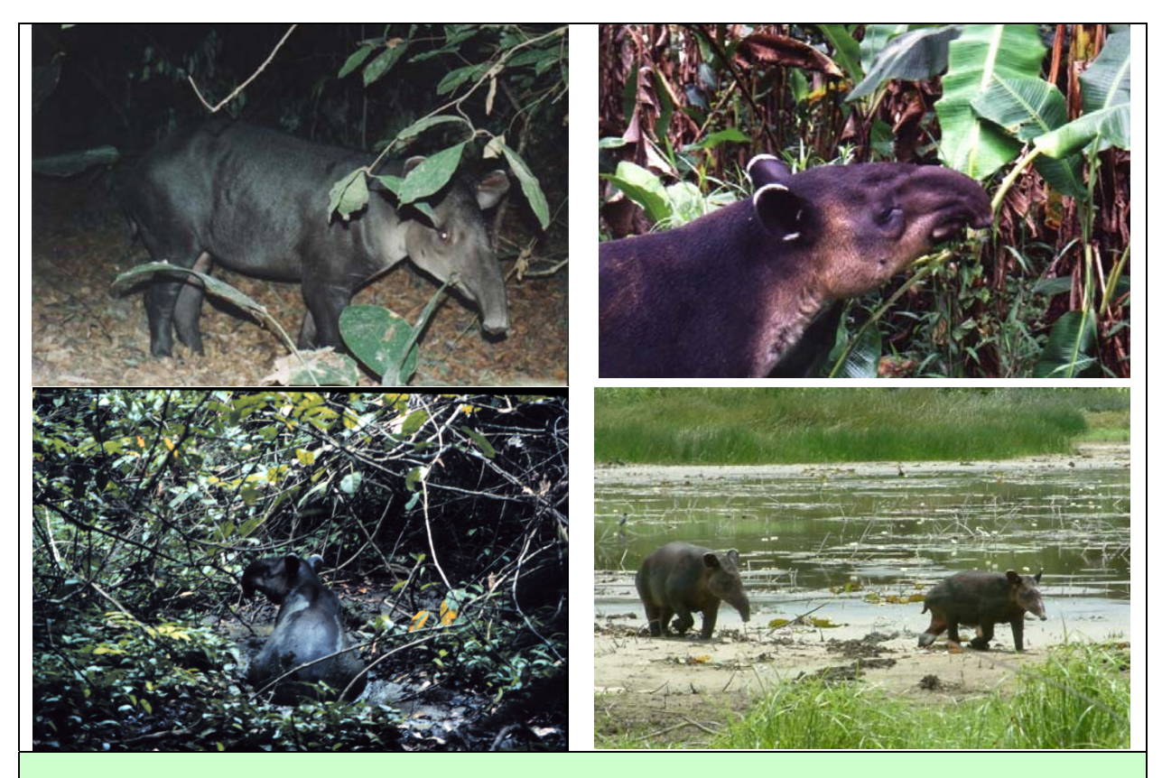
Fig. 2. Habitat, habits, and signs of Baird's tapir ( Tapirus bairdii ). A-C: tapirs in tropical rainforest of the Lacandon Forest, Chiapas. D: adult female tapir and her young in a waterhole of Calakmul, Campeche.

In the near future, it will be important to generate information about the age structure and sex ratios of tapir populations in other areas of Mexico. Knowing these variables may help to detect habitat or population management needs for tapir conservation, especially in non-protected areas where hunting is persistent.